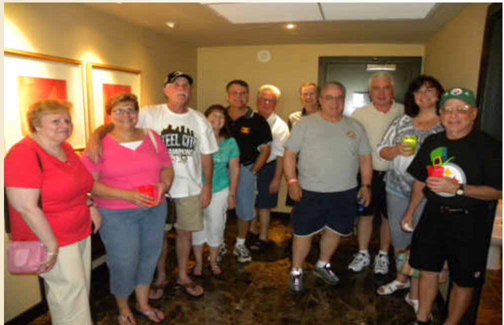
The Crew from Pittsburg, enjoying their visit to the hospitality suite.

Golfnut is still on hiatus. The 'Nut wishes everyone a great time at Eagle Glen ! On the next two pages are some pictures from our recent Red Rock Vegas event.