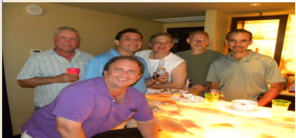
The Boys from Texas, havin' a good time!