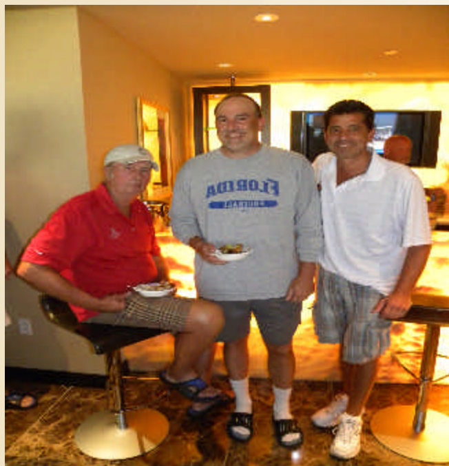
Hanging out, enjoying the Sunday mixer.