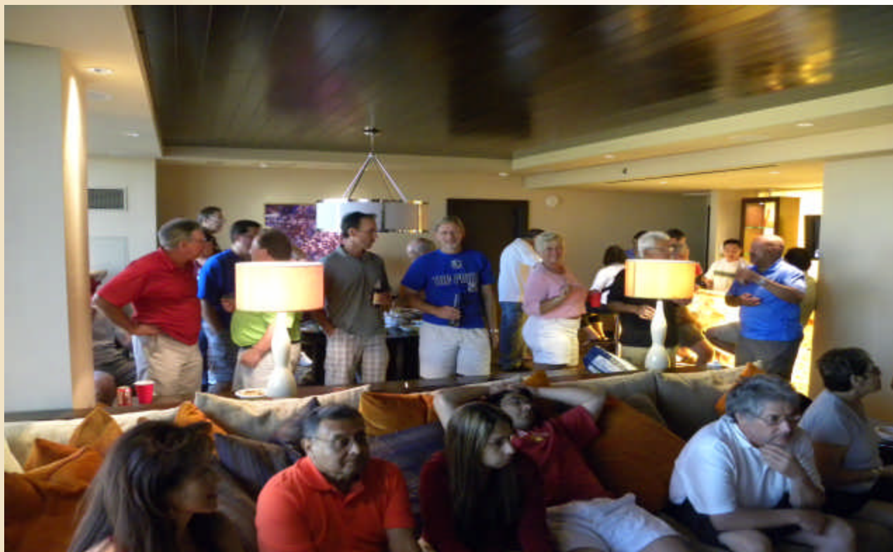
Having a good time watching the NBA Finals at the President's Reception. Nice room!