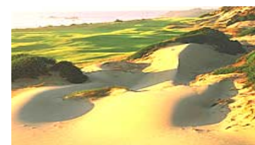
Above: Picture of the 13th hole at the Pacific Dunes Golf Course in Bandon, Oregon, the future home of the ALSRIWEST event in 2016?