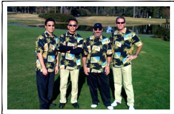
Picture of the ALSRI members participated in the IRS East Coast event in Myrtle Beach back in 2007 donning an unusual golf attire bought at Tommy Bahama Store prior to the event. They called themselves, "The Bahama Boys."