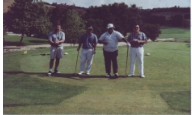
Monterey Madness Participants