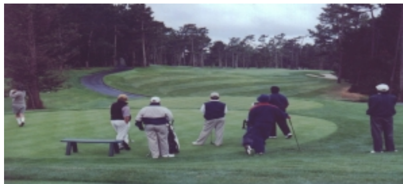
Teeing off on #1 at La Pursima Golf Course

If you haven't had the opportunity, take a few minutes and join the ALSRI private chat room between 8 and 10 on June 8th. The smack will start promptly at 8PM. To get to ALSRI Private Chatroom, on your AOL screen, CLICK "PEOPLE", then click "FIND PRIVATE CHAT" to find name screen. Then type "ALSRI" to join. Hope to see you there!!!