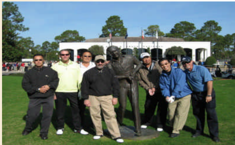
2007 IRS & Friends East participants getting swing tips from "Arnie"!